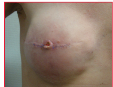
In-office closure after 3 weeks in treatment with Endoform dermal template — wound was re-epithelialized