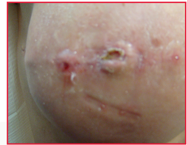
Wound presented measuring 0.8cm x 0.7cm x 0.3cm deep